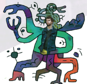
ARIEL TESSIER an almost immanent drummer as a fire of life in everything